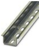
DIN rail perforated, Standard profile, width: 35 mm, height: 15 mm, similar to EN 60715, material: Steel, galvanized, passivated with a thick layer, length: 2000 mm, color: silver

DIN rail perforated - NS 35/15 PERF 2000MM - 1201730